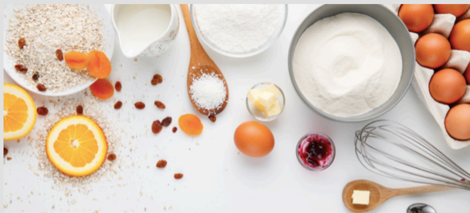
Cake and Chat : Last Sunday of the month!